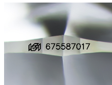
Sample Image Used