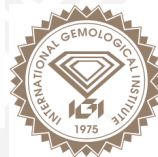
HEARTS & ARROWS